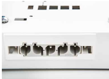
Special version with EnstoNet connector

DPML can be installed as standard to T-list ceiling. Surface mount, plasterboard ceiling and concealed grid installation with accessories.