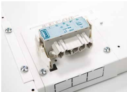
Linect EnstoNet -adapter (DALI)