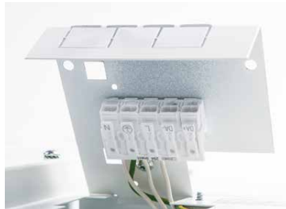
Installation with terminal block (DALI)