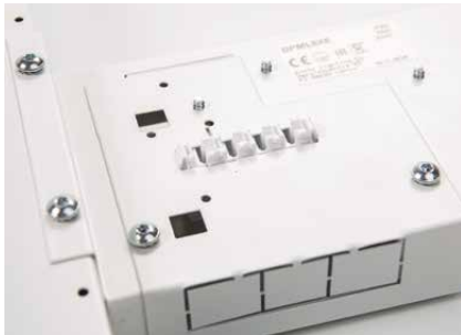
Linect connector as a standard (DALI)