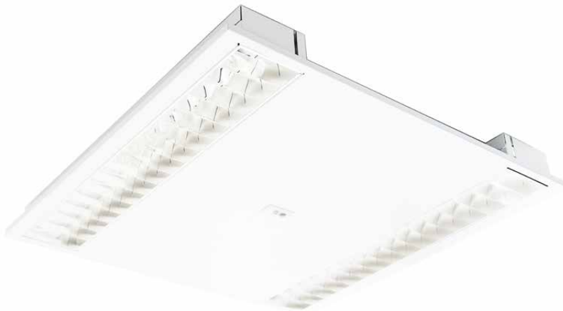
With Active+ sensor